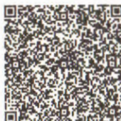
Socwarni Direktur Utama

Diterbitkan di Bogor, Indonesia Disahkan oleh,